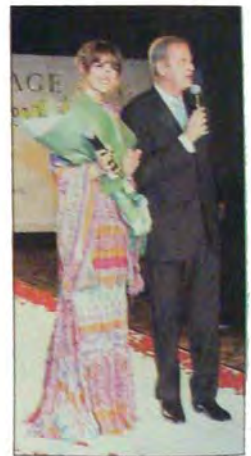
Italy Gala Dinner in 2007